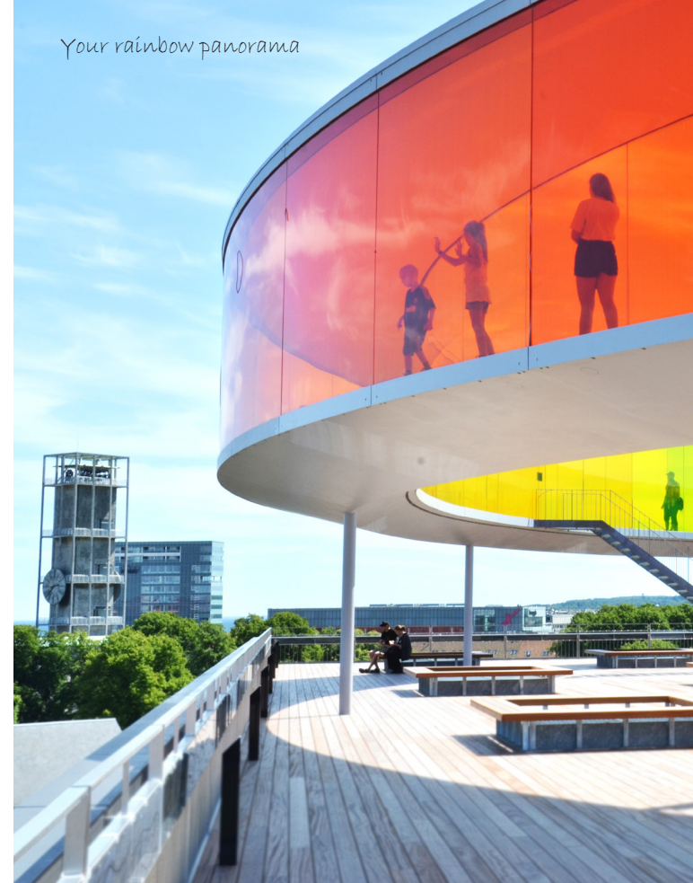
Your rainbow panorama

partner universities spread all over the world.