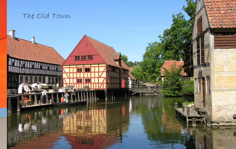
The Old Town