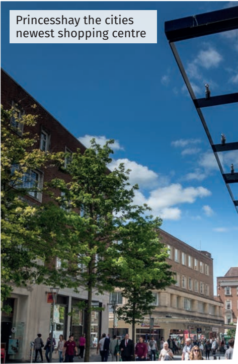
Princesshay the cities newest shopping centre