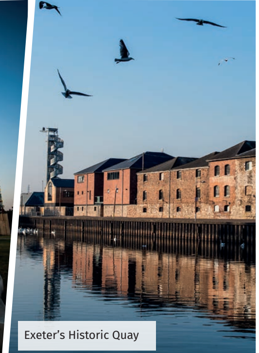
Exeter's Historic Quay